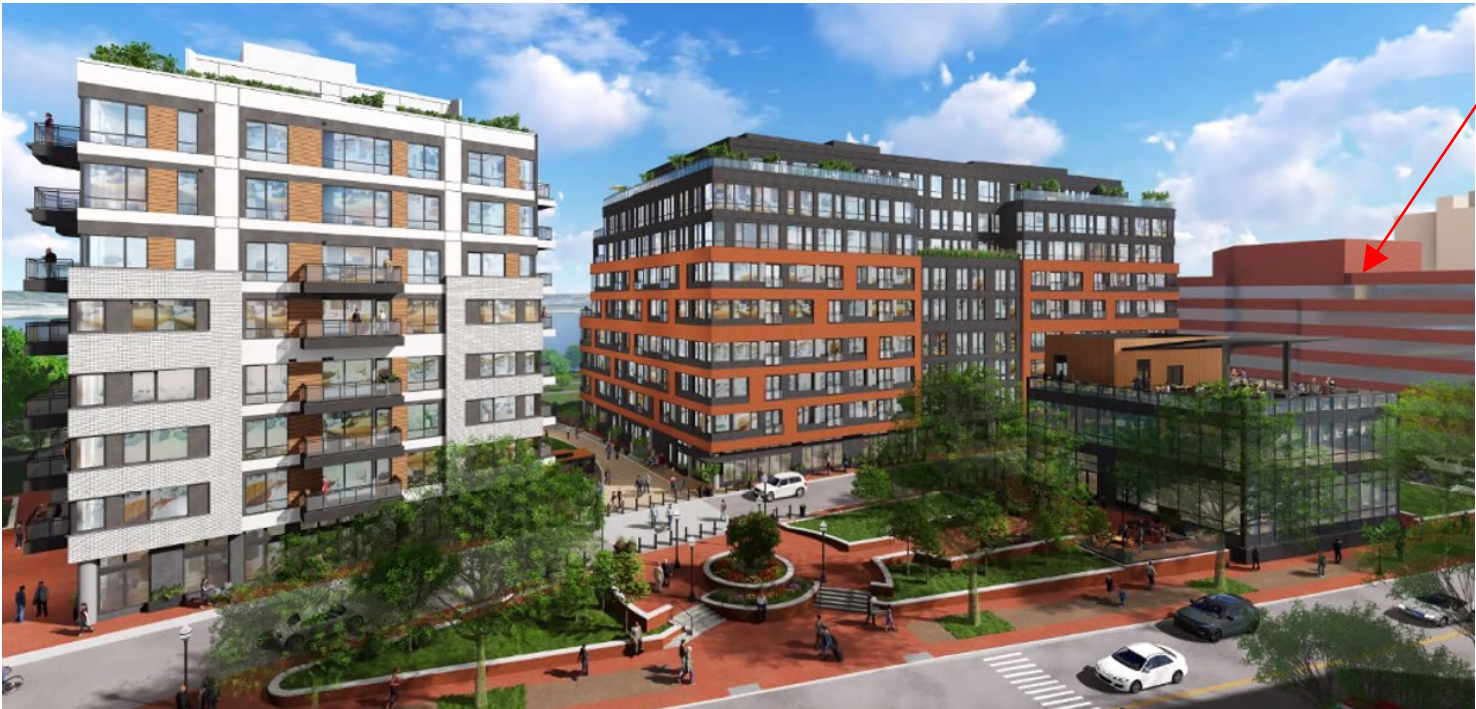
AOC HQ Building