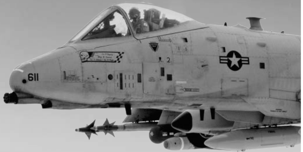
TWTs still power most of the jammers used today, such as the jamming pod on the outer-left weapons station of this A-10.